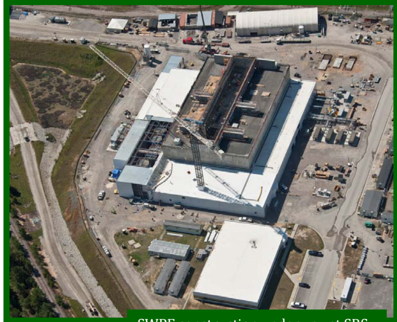
SWPF construction underway at SRS

Nuclear material production operations at SRS resulted in the generation of liquid radioactive waste that is being stored, on an interim basis, in 49 underground waste storage tanks in the F- and H-Area Tank Farms.